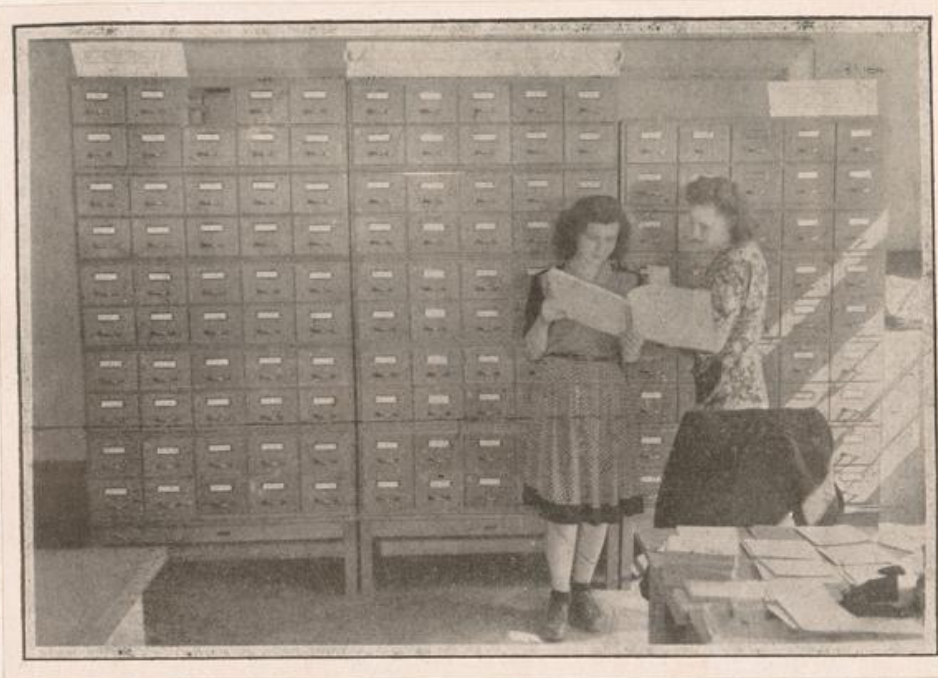
Comparing the cards of our Deportation Index with the discovered Gestapo Lists

that the German courts, which had begun to issue death declarations for missing persons, began to solicit our assistance for death declarations requested by relatives of the deportees. The very same index also acquires significance as a source of information on confiscated Jewish properties.