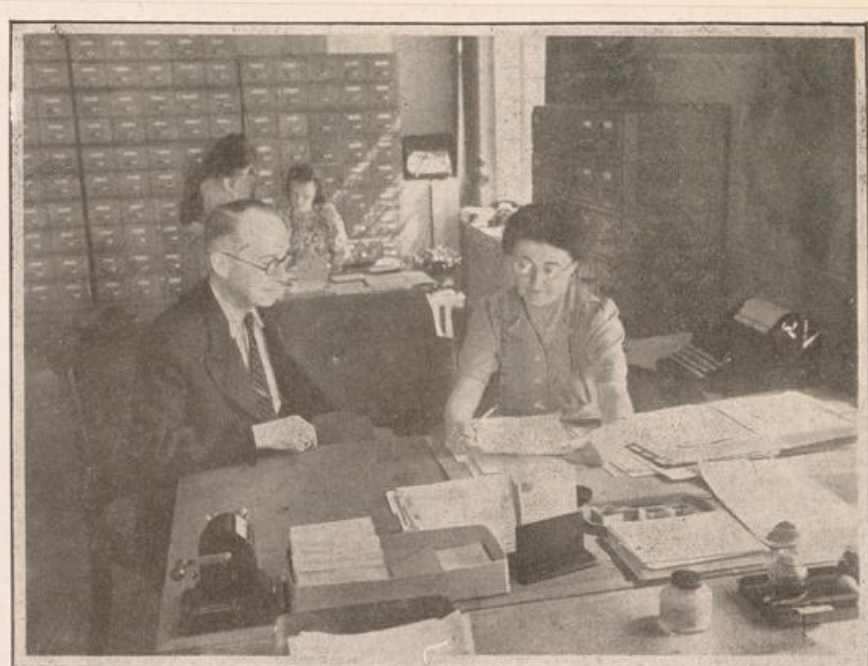
Results of interviews and investigations are being discussed before further steps are taken