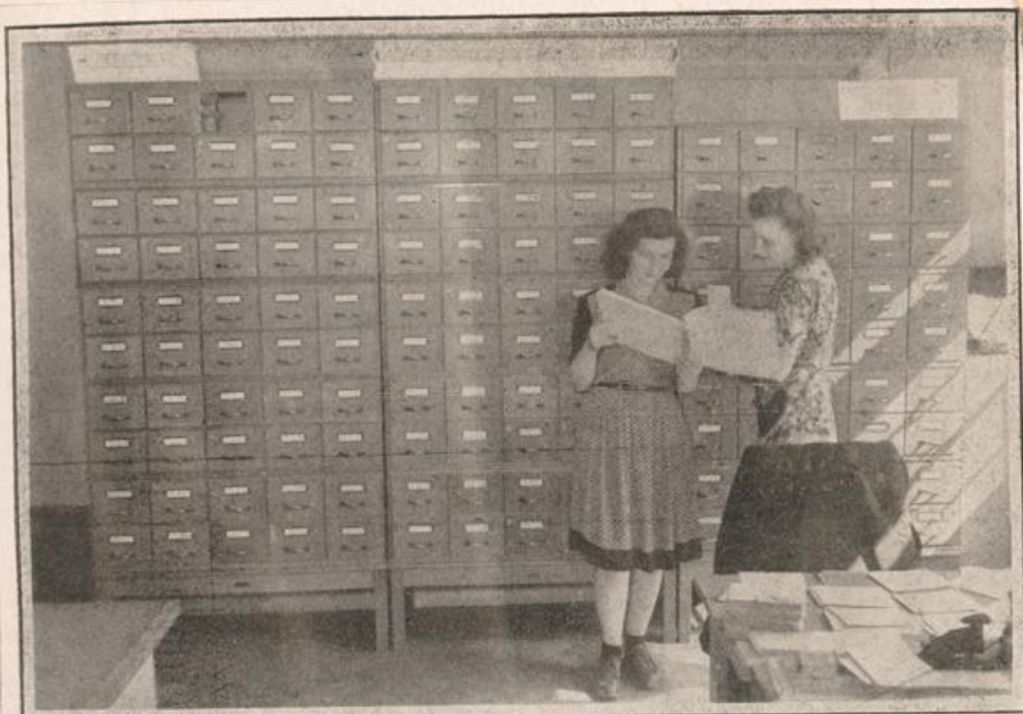
Comparing the cards of our Deportation Index with the discovered Gestapo Lists

that the German courts, which had begun to issue death declarations for missing persons, began to solicit our assistance for death declarations requested by relatives of the deportees. The very same index also acquires significance as a source of information on confiscated Jewish properties.