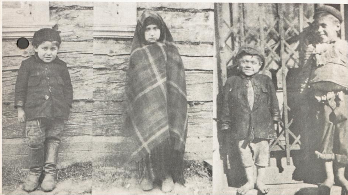
Four JDC clients.