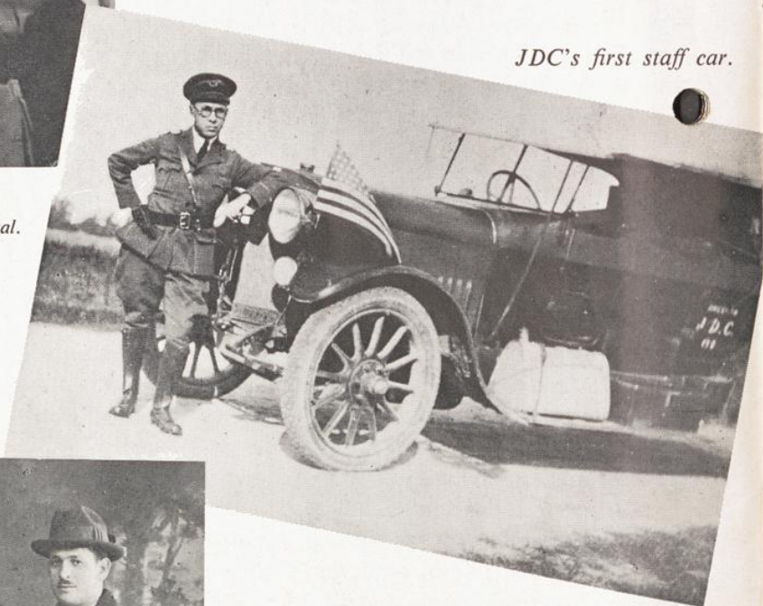
JDC's first staff car.