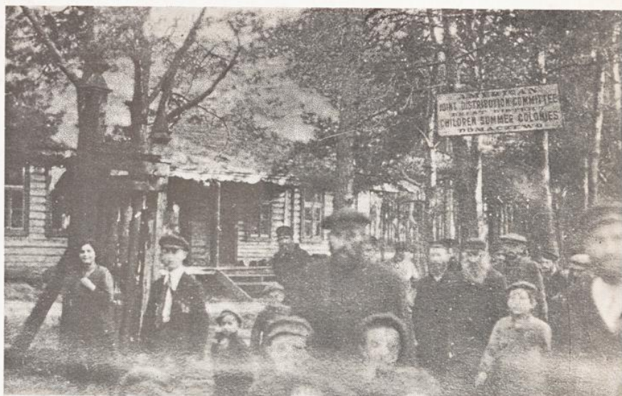
JDC's first fresh air camp.