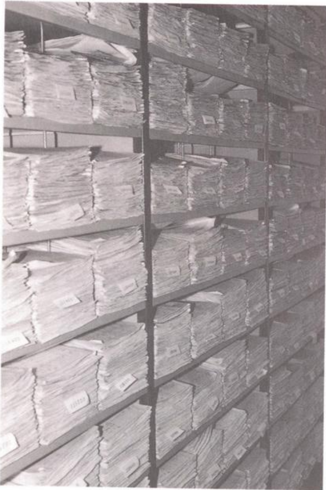
Final deposit of processed cases