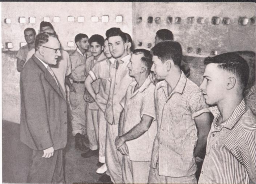
Nicaragua, 1959. An ICRC delegate in conversation with political detainees.