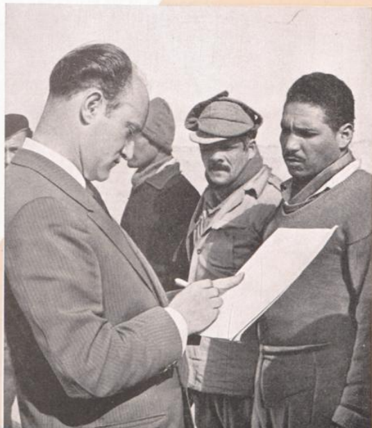
The Suez conflict. An ICRC delegate visits a prisoner-of-war camp.