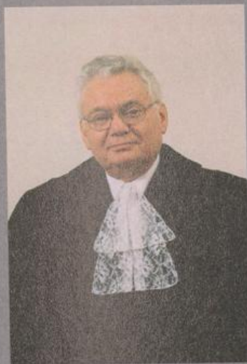
Thomas Buergenthal as a Judge at the International Court of Justice , The Hague, circa 2003

Thomas Buergenthal documented his family's persecution by the Nazis and the dramatic search after 1945 in his autobiography A Lucky Child: A Memoir of Surviving Auschwitz as a Young Boy .