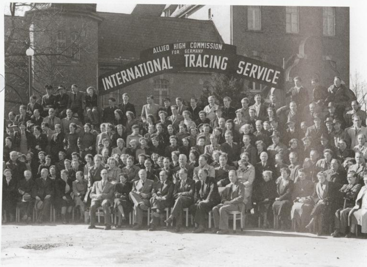
Employees in Front of the ITS Headquarters, on the Grounds of the Former SS Barracks, Arolsen, 1952